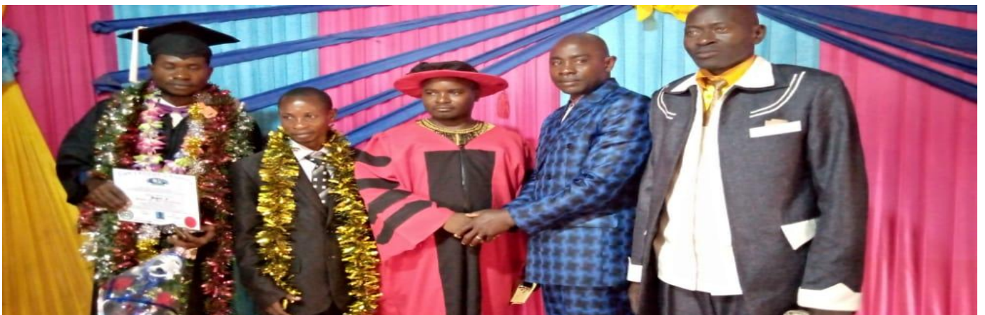
Graduation ceremony held in Malawi