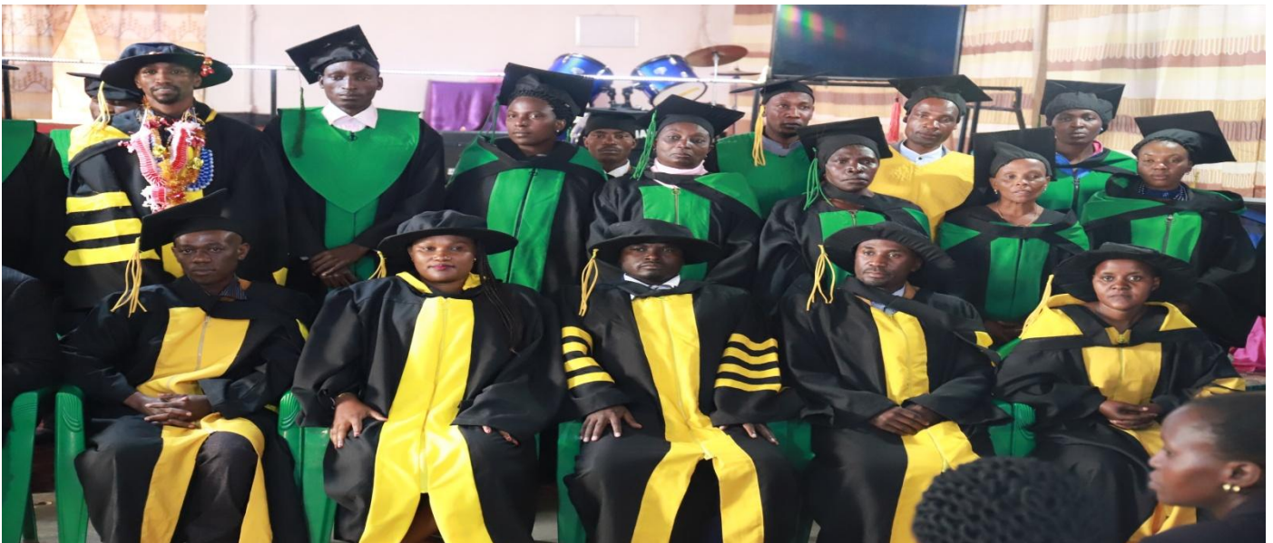
University Staff (sitting in front) with Graduates at graduation ceremony held at Iringa Learning Centre