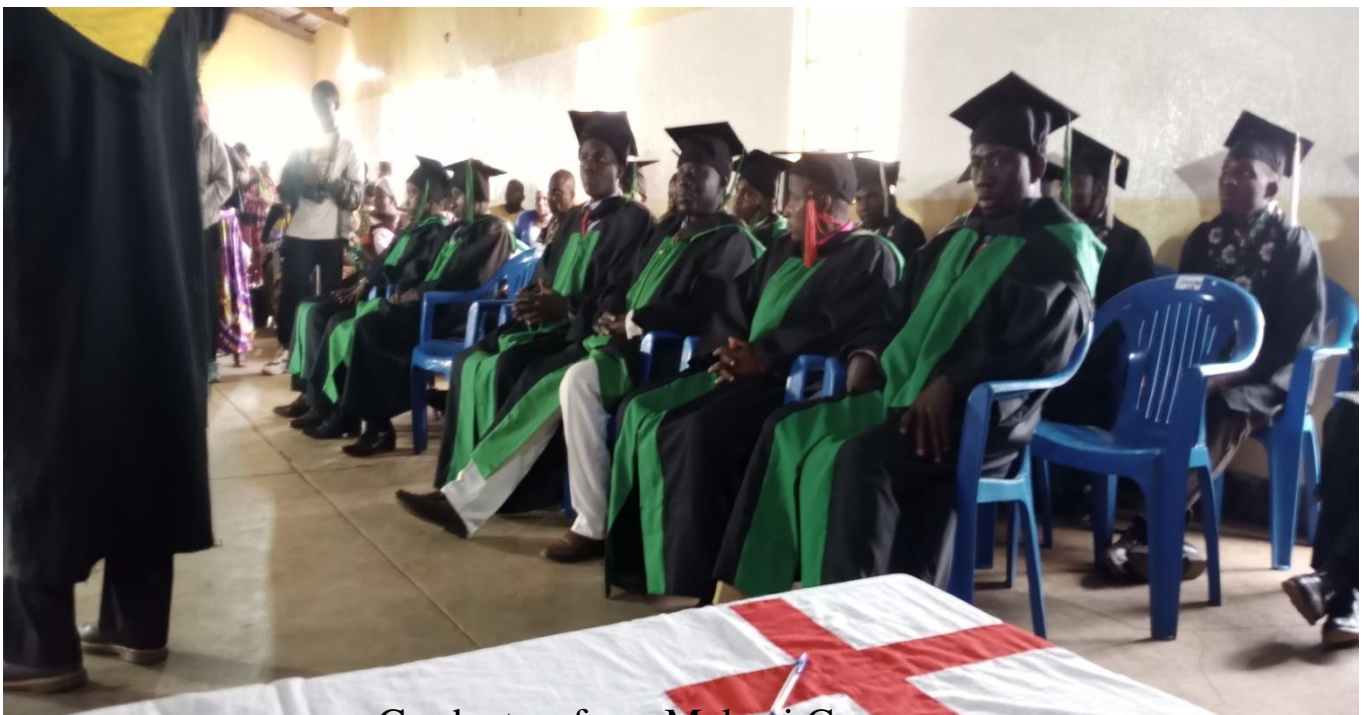
Graduates from Malawi Campus