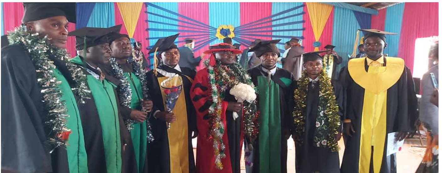
University staff with graduates at graduation ceremony held at Dzaleka Learning Centre in Malawi