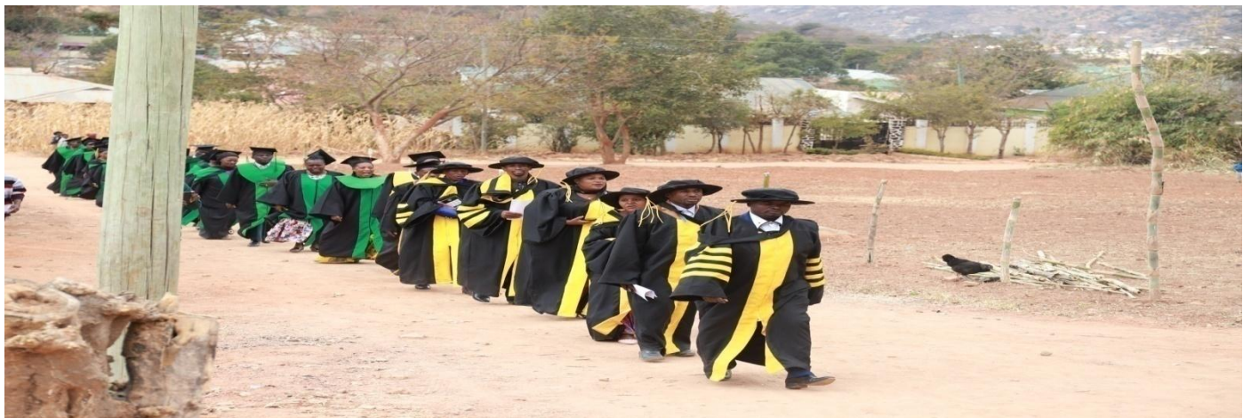
Graduation Ceremony Held at Iringa Learning Centre in Iringa Region