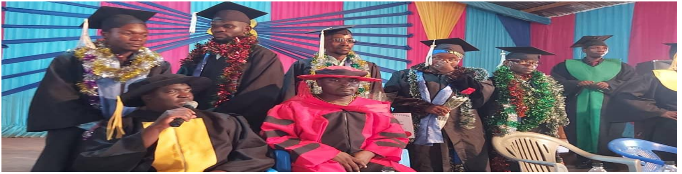
Graduation ceremony held in Malawi